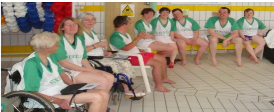
Every Turtles competitor won a medal at Hatfield—well done to the team!